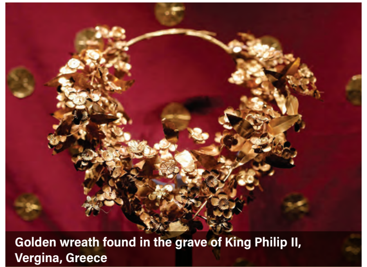
Golden wreath found in the grave of King Philip II, Vergina, Greece

After breakfast at the hotel, transfer to the airport for the flight homeward. (B)