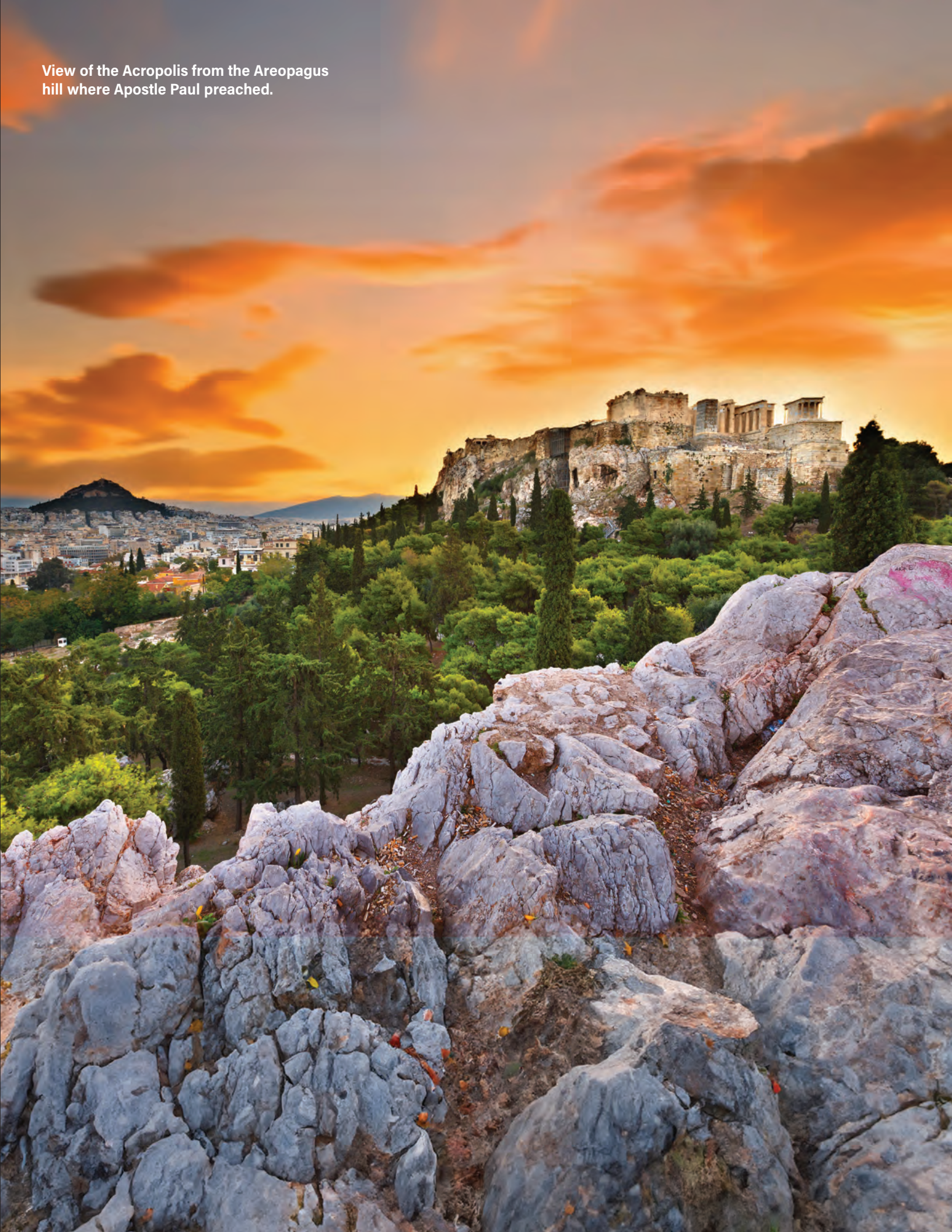
View of the Acropolis from the Areopagus hill where Apostle Paul preached.