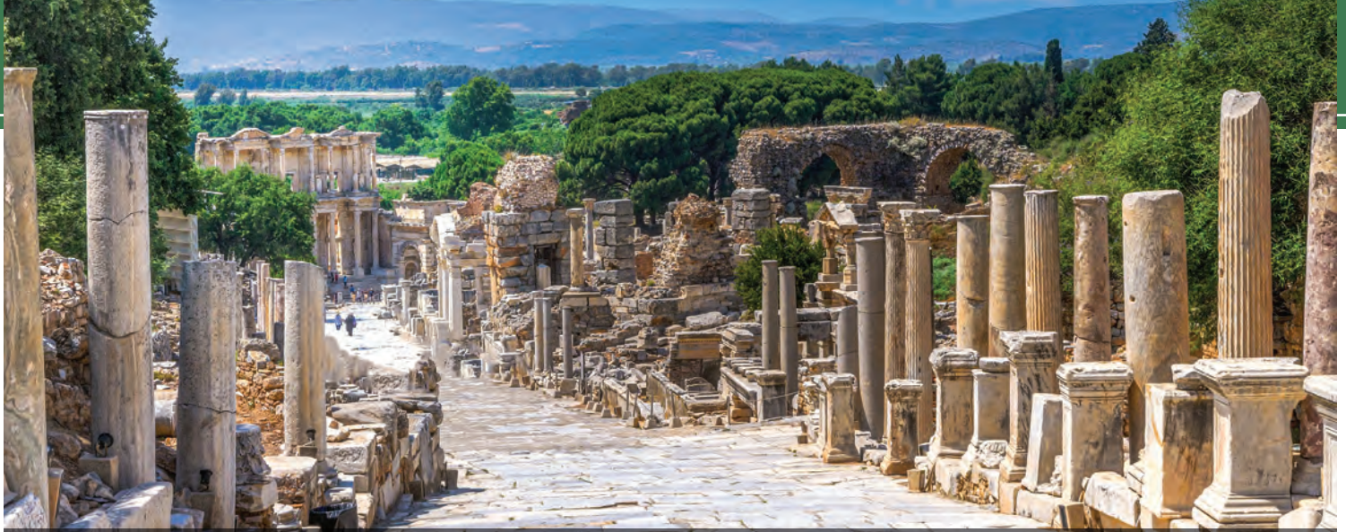
Street of Kuretes, the same street Apostle Paul walked on during his stay in Ephesus, Turkey