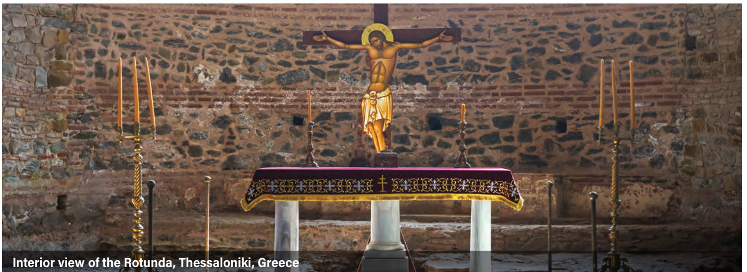
Interior view of the Rotunda, Thessaloniki, Greece

Today, a full-day excursion takes us west to the ancient towns of Veroia and Vergina. According to the Book of Acts , after Paul received a vision to spread the gospel in Macedonia, he stopped in Thessalonica, where his message was not well received, and then continued to Veroia (Berea), where the local Jews "received the word with great eagerness." The memory of Paul's visit here led to the building of more than 70 churches in the town, 48 of which are still preserved. After visiting this "Little Jerusalem," we travel to the World Heritage Site of Vergina, an early Macedonian royal capital and the burial place of kings. In 1977, archaeologists discovered sumptuous royal tombs here, including that of Philip II, father of Alexander the Great. Philip's tomb yielded incredible treasures in gold, which are housed in the local Archaeological Museum. (B,L)