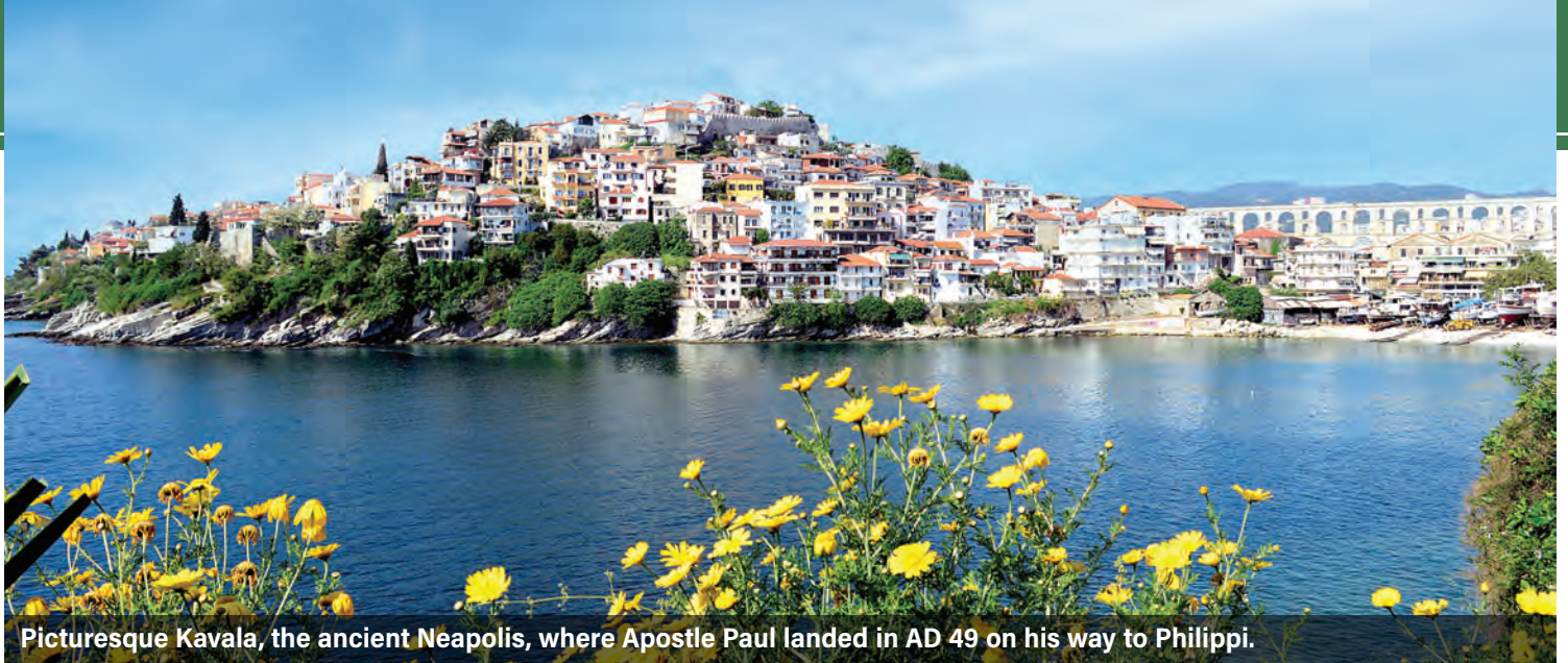
Picturesque Kavala, the ancient Neapolis, where Apostle Paul landed in AD 49 on his way to Philippi.

the monastery consists of a library and several chapels that house a marvelous collection of Byzantine art, including countless frescoes, icons, gold and silver liturgical objects, and rare manuscripts. After the monastery, enjoy some time in charming Chora, the island's main town, where we have lunch before returning to Samos and our hotel. (B,L,D)