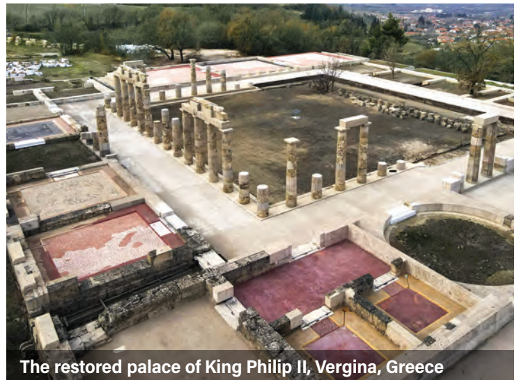
The restored palace of King Philip II, Vergina, Greece

Today, we travel to Patmos, the island to which John was exiled from Ephesus in AD 95 by the Roman Emperor Domitian, and the place where he received visions of the Apocalypse, which were later recorded in the last book of the New Testament . We will visit the small cave where, according to tradition, John received visions, and we will tour the imposing fortress-like Monastery of John, built in 1088 on a ridge above the main town. In addition to the church of Apostle John,