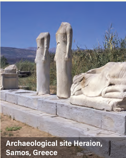
Archaeological site Heraion, Samos, Greece

NOTE: Thalassa Journeys is providing the three domestic flights within Greece for which the total cost is estimated at $550, which will be reflected on your final invoice.