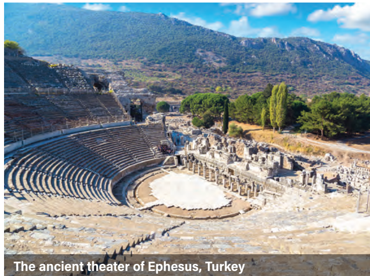
The ancient theater of Ephesus, Turkey

After breakfast at the hotel, depart on a flight to Samos, one of the most powerful city-states of ancient Greece, enjoying its greatest prosperity in the 6th century BC, through trade with communities stretching from Egypt to Spain. On arrival, tour the island's most important monuments, including an enormous shrine (the Heraion)