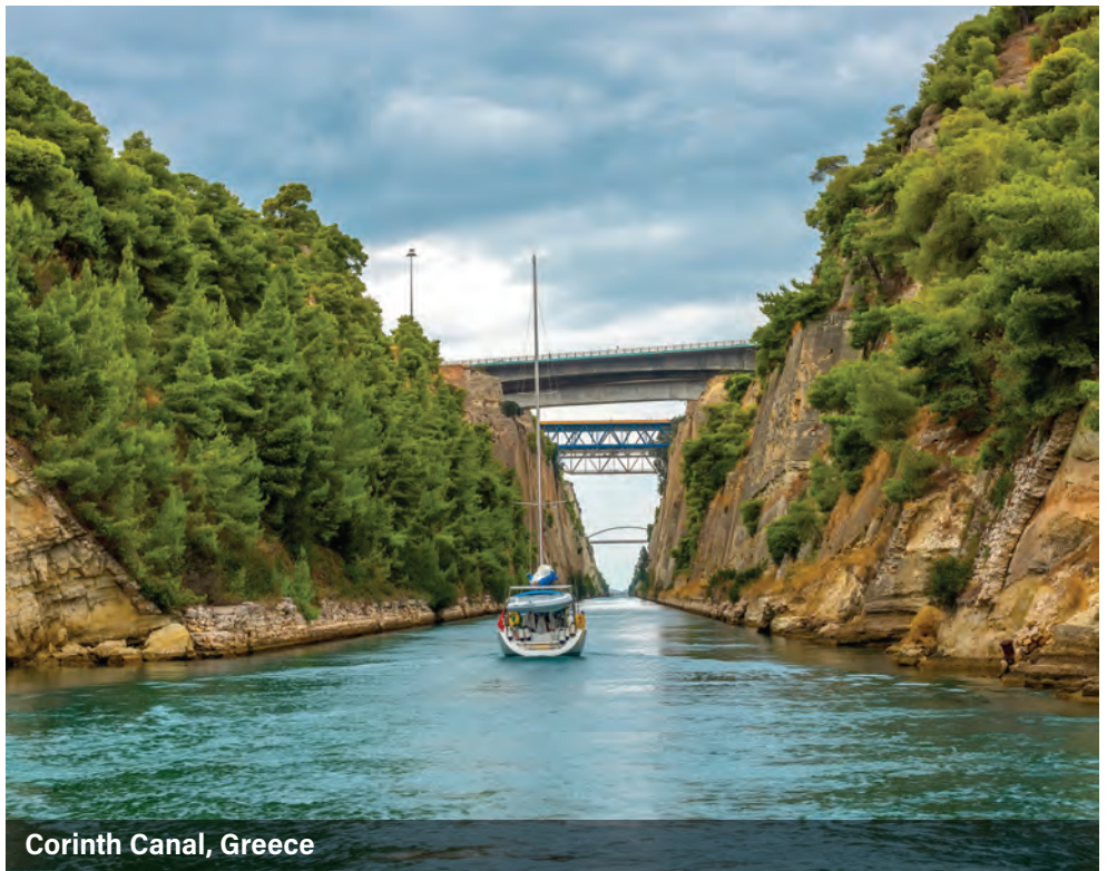
Corinth Canal, Greece