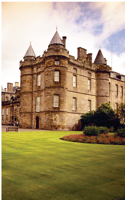
Scotland is home to more than 1,000 castles.

Day 12: Depart for U.S. We transfer this morning to the Edinburgh airport for our return flights to the U.S. B