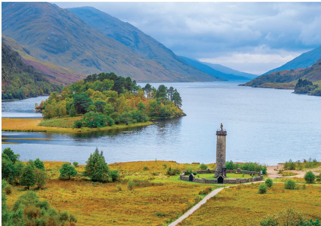
We'll visit the Glenfinnan Monument honoring "Bonnie Prince Charlie" on Day 5.

Day 5: Fort William/Isle of Skye We embark on a full-day excursion to the Isle of Skye, the largest of Scotland's Inner Hebrides known for its vivid history, strong Gaelic influence, and stunning scenery. En route, we make a photo stop at Glenfinnan Monument honoring "Bonnie Prince Charlie" for his leadership in the Jacobite Rising of 1745. Then we board a ferry for Armadale on the southern tip of the Isle of Skye, where our touring begins with a visit to Armadale Castle and Gardens, where we have lunch. Next we set out on a scenic drive through the imposing Cuillin Hills (or "Black Cuillin"). Returning to the mainland via the Skye Bridge, we stop to visit iconic Eilean Donan Castle then dine tonight at our hotel. B,L,D